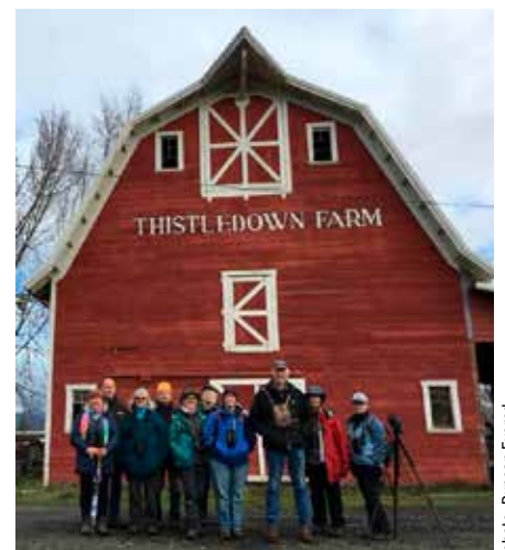
CBC birders taking a photo break