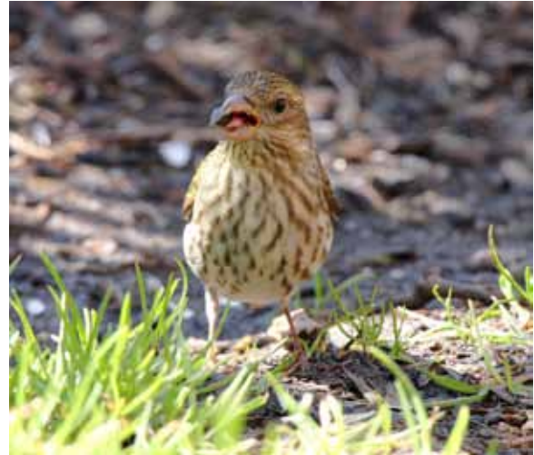
Female Purple Finch—Cary Kerst

Feel free to contact dschlenoff@msn.com for status updates or check out our webpage or Facebook page. A good tool to check the status of bills in the legislature is http://gov.oregonlive.com/bill/ .