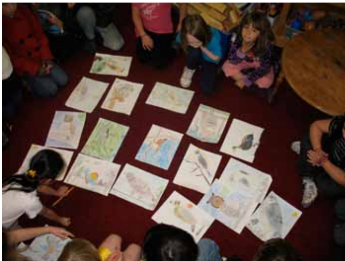
Audubon in the Schools 2nd graders.

If you are interested in training to teach in the Audubon in the Schools program, please call Kris Kirkeby at 541.349.2439 or email at k2krik@comcast.net.