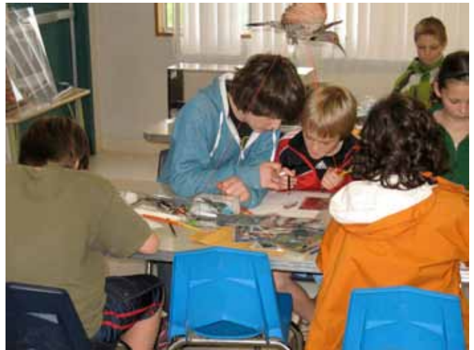
Audubon in the Schools 5th graders.

We want to guarantee we can book all the requests we get, so we would like to add more people to our Fall Term roster. The training would take place in late summer. We have instructors who are fabulous bird people and others who are more artistic in their talents. Our training equips both types of instructor to enjoy these classroom experiences. We simply look for volunteers who love birds and enjoy teaching young children.