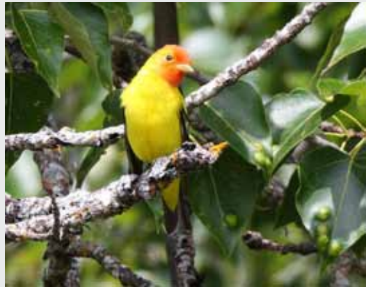
Western Tanager by Kit Larsen

Eugene Garden Club 1645 High Street, Eugene