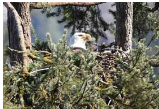
Nesting Bald Eagle At Skinner Bute —Cary Kerst

When May and June arrive, birdwatchers are treated to the annual nesting activities of birds that breed in Lane County. We watch males perform rituals to attract females, and many of these activities are predictable and amusing in their repetition. I